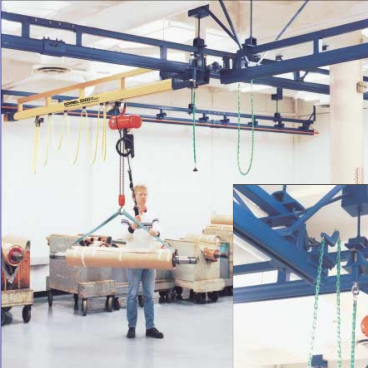
This view shows a close-up of Gorbelt Interlock/Transfer Cranes