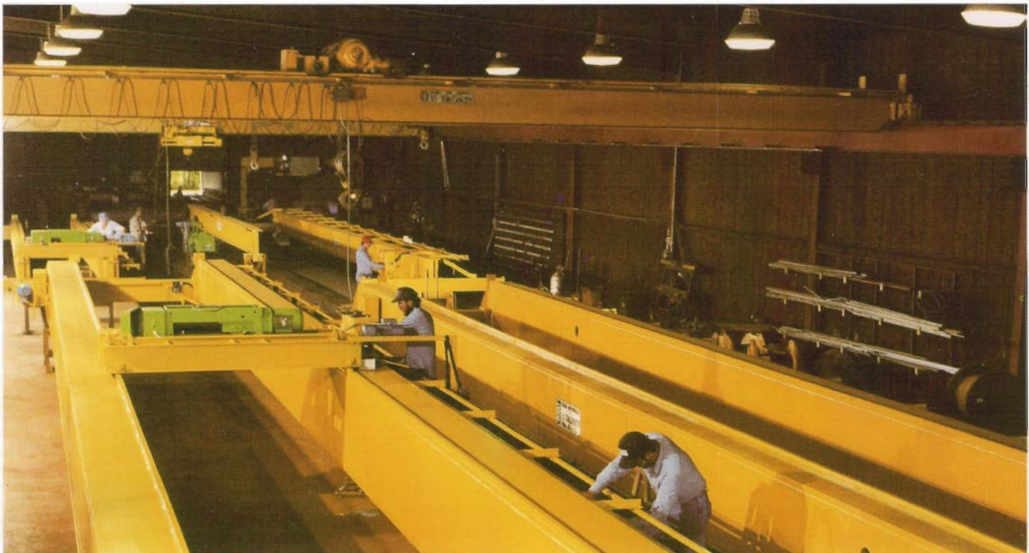
FABRICATION & FINAL ASSEMBLY